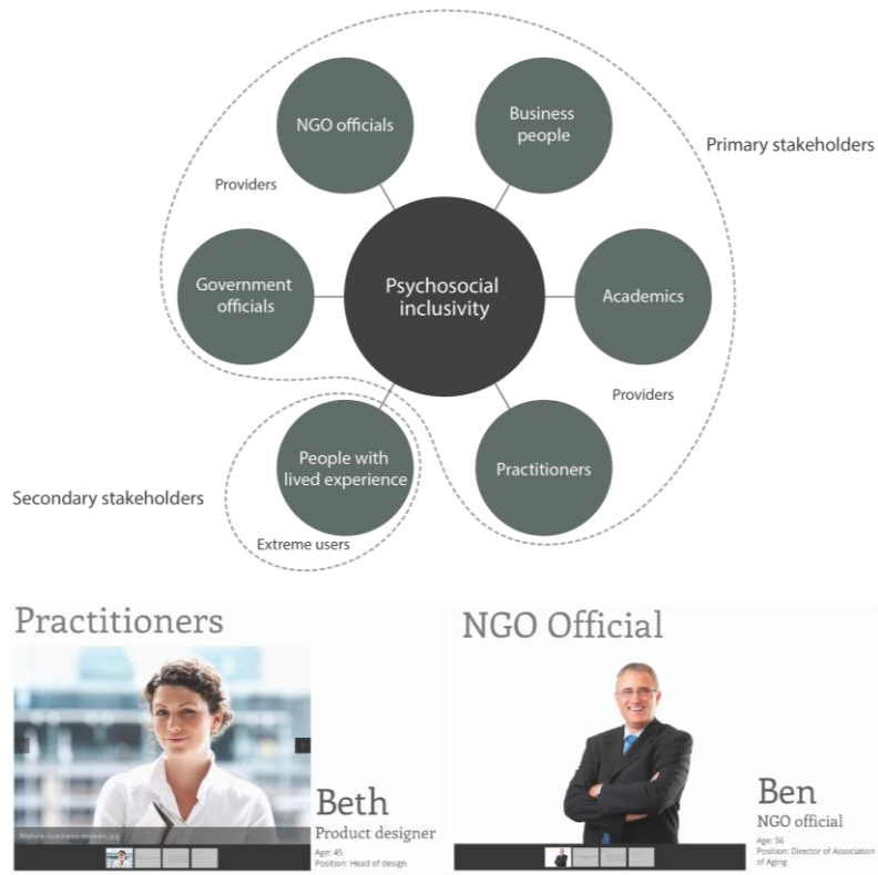
Fig. 2 Stakeholder model (above) and examples of personas (bottom) of psychosocial inclusion for Delphi interview study ( http://tinyurl.com/pw7vhoh )

In the first round of interviews, the selected experts will be mainly asked about their opinions on how important psychosocial aspects in inclusive design are and what contexts of existing psychosocial aspects in their own areas are to explore the general ideas of psychosocial aspects. In the next round, the working definition and framework will be provided in order to be developed through data from interviewees' expertise and experience.